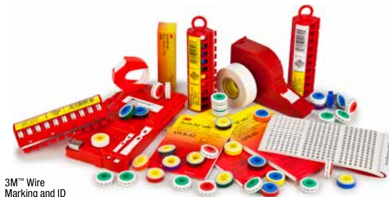
3M™ Wire Marking and ID

3M is a trademark of 3M Company. DYMO is a trademark of Newell Rubbermaid, LLC, Inc.